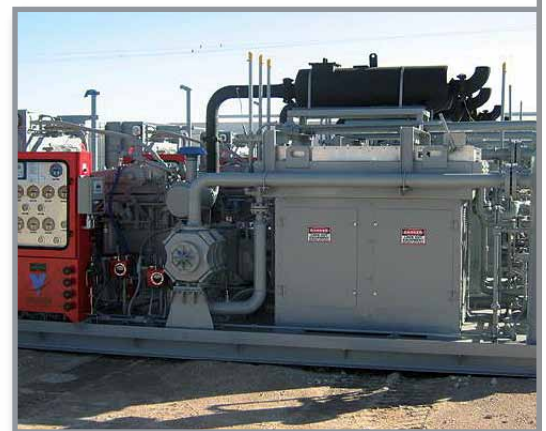
West Texas: The VX-Series' slide-in feature, which does not rely on moving parts or a complex loading apparatus, allows users to safely and easily lift/install/remove catalysts.

Learn More: Phone · Email · Web · "The Emissions Monitor" Subscription